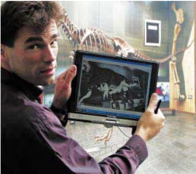
Figure 6: Mobile Dino Hunter application with Augmented Reality on a Tableaut PC

and fictive story content are therefore tracking-procedures is used to determine the location. The »magic-equipment« enables novel input and output interaction metaphors. It consists of AR-binoculars, Audio-playback-units, and several props. Additionally, the »magic book« provides the possibility to use various GEIST databases directly.