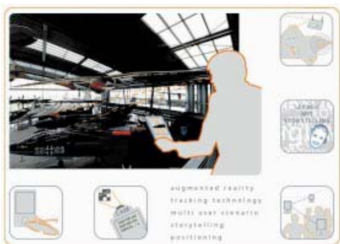
Figure 5: MobiTain Scenario for mobile edutainment applications

The interactive Digital Storytelling-environment controls the story's cycle while considering user-actions, it keeps the line of suspense, builds up scenes, controls the characters, and sets the possibilities to interact. Several databases providing historical facts