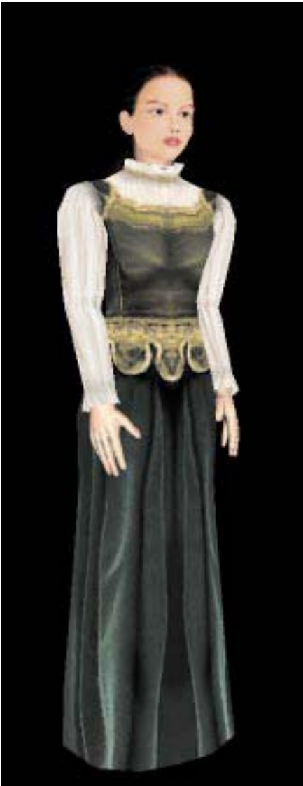
Figure 3: Virtual Character Katharina as main character of the GEIST scenario

Art-E-fact addresses especially artists and designers and tries to incorporate their way of creating pieces of art into the platform. Hence, the platform serves as a medium for the presentation of information about art and it offers a new way of creating pieces of art. The artist is enabled to provide information in an exciting way of storytelling and to design the behavior and look of the virtual conversational partners. Moreover, the artist can design and integrate specialized virtual and physical interaction metaphors. Applying mixed reality and interactive storytelling offers new ways to experience, explore and recognize art. As an exemplary application and proof-of-concept, the art-E-fact project implements an artistic exhibit, which demonstrates the system's