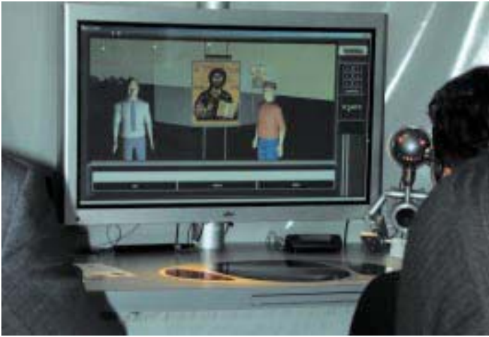
Figure 2: art-E-fact proto- type presented on the IZA platform

The IZA platform has been used to realize a specialized mixed reality information kiosk system for ZGDV. It serves as an interactive information desk and provides information about the ZGDV and its projects in a proactive manner. Due to its generic architecture, application scenarios range from interactive presentations of artwork in the context of culture and arts to novel forms of point of information and sales systems (POI/POS).