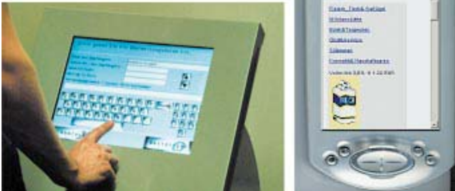
Figure 2: The PoS / PoS terminal as an automatic teller machine and the personal assistant showing shopping possibilities

the EMBASSI system combines and interprets the single user utterances consisting of the commando and the gesture so that the television set will adjust the loudness.