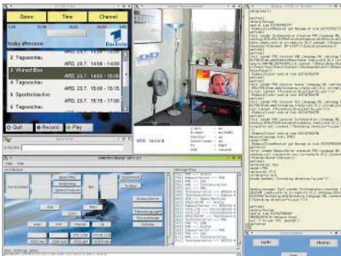
Figure 5: OpenEMBASSI