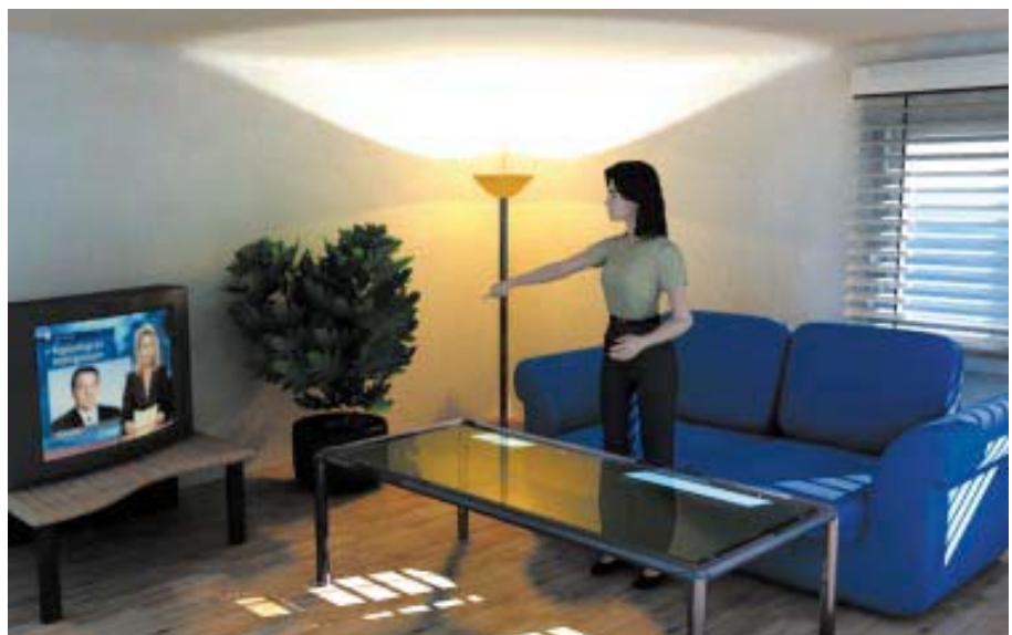
Figure 1: A home infotainment scenario that points out the multimodal interaction possibilities of the user with his personal home environment

EMBASSI (Elektronische Multimediale Bedien- und Service Assistenz) war eines der sechs Leitprojekte der Mensch-Technik-Interaktion des Bundesministeriums für Bildung und Forschung (BMBF). 20 Partner aus der Industrie und Forschung waren an diesem Verbundprojekt beteiligt. In drei Anwendungsszenarios (Privathaushalt, Kraftfahrzeug und Terminalsysteme) wurden auf Basis der generischen EMBASSI Architektur Komponenten zur multimodalen Interaktion und zur Unterstützung von Benutzern mittels Assistenztechnologien entwickelt. Viele der in EMBASSI entwickelten Arbeiten fließen in neue Projekte ein. Ein kompletter Demonstrator kann unter www.embassi.de als Open-EMBASSI heruntergeladen werden.