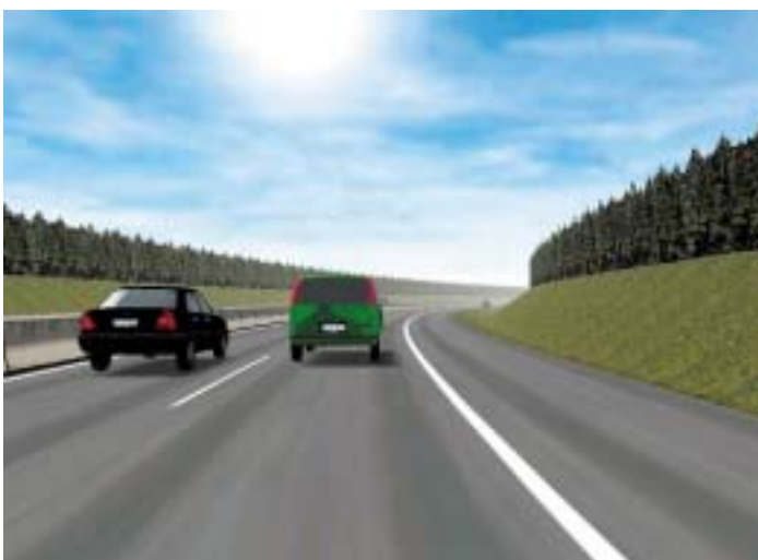
Figure 3: The driving simulator of the car environment

To assist users (in particular handicapped people) using terminals, innovative interaction possibilities with terminals and personal multimedia assistants were developed and demonstrated prototypally (cf. figure 2). The personal multimedia assistants are separate devices locating terminals and their services in the nearer environment. Interaction is possible with speech, by touch screen, joystick, or even braille. The following demonstration scenarios were realized: the usage of a cash terminal and the usage of a vending machine with individualized purchase lists. While interacting with the terminals and the personal assistants, the user is assisted by adaptive interfaces using macros for individualized interactions. To secure the communication of the different agent management systems, running on the terminals as well as the personal assistants, the EMBASSI agent platform is able to detect and to connect different independent agent platforms and to make interoperability possible of agents belonging to different platforms. Through this development it has become possible that a vendor agent running on the personal assistant communicates with the appropriate agent on the vending machine to assist the user in the best possible way, for instance.